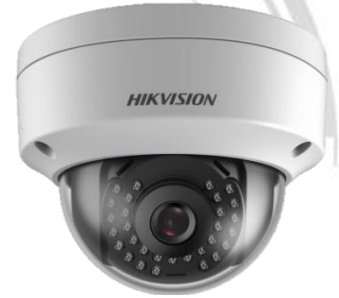
4 mm Fixed Lens