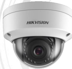
2.8 mm Fixed Lens